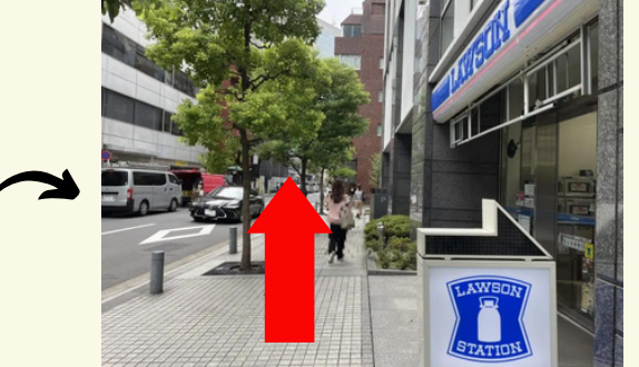
2 After getting off the elevator, Please change direction to the right.