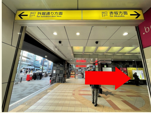
① Please go out from [Exit 10 for Akasaka].