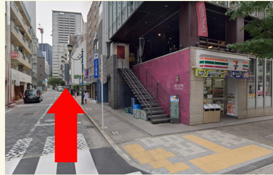
④ after you walk straight and pass two intersections, You will see a 7-Eleven, so please proceed straight ahead.