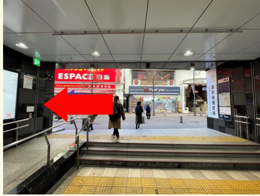
② After go out the street on the front, Walk to the road on your left.