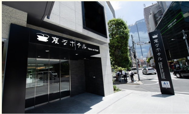
Welcome to Henn na Hotel Akasaka!